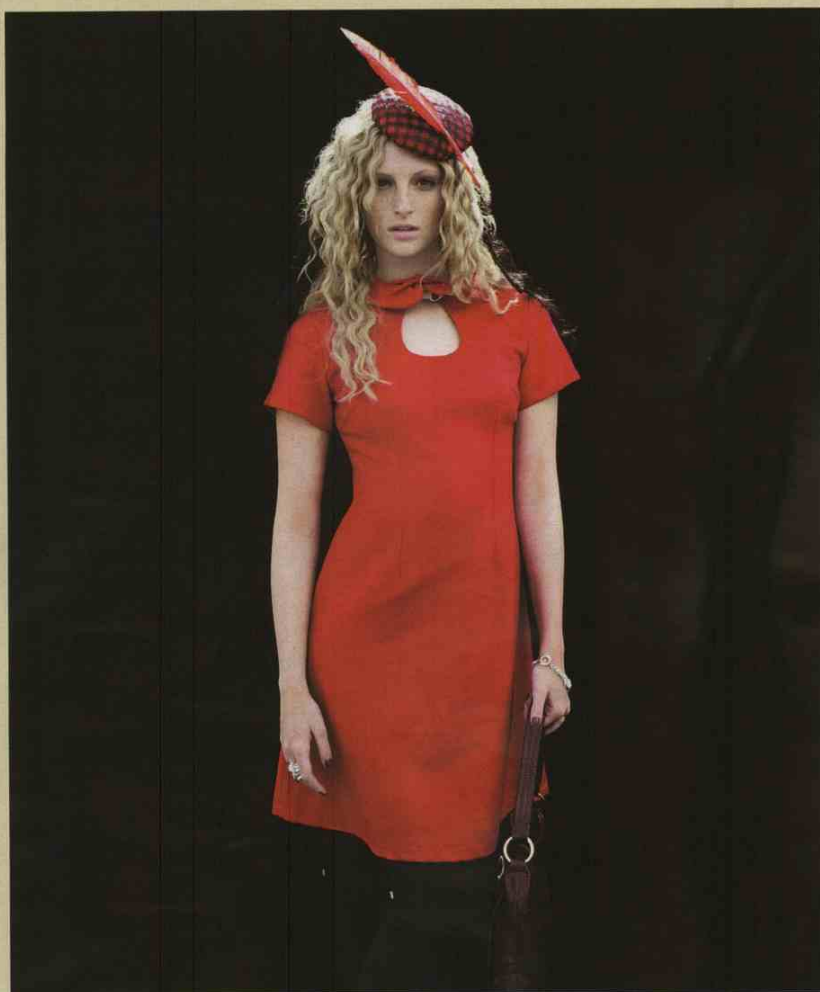
Above Dress, €245, EssenC; hat, €275, Martha Lynn; necklace, €495; bracelet, €275; ring, €400, all Ruby Jewels; bag, €179, Ana Faye, all Project 51. Boots, €1,825, Gucci, Brown Thomas Dublin. Tights, stylist's own